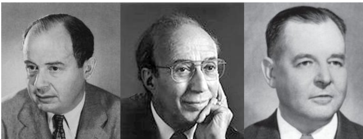
John von Neumann (1903-1957)